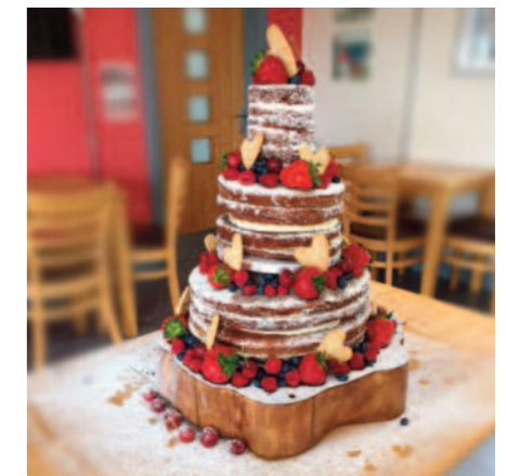
NBF Cake Stand